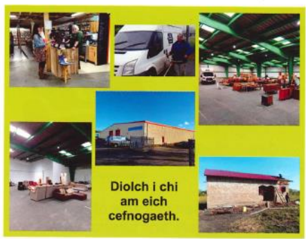
"Striving for Excellence in Supporting Vulnerable People"

As a registered charity, we collect and sell donated furniture, creating employment opportunities for individuals from marginalized backgrounds. Our mission is to provide meaningful work and support to those who need a second chance.