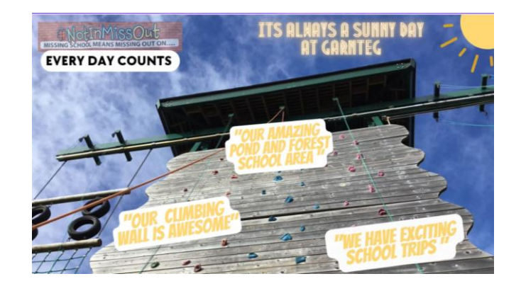
This week's attendance figures are