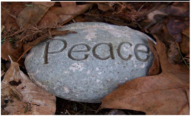
Gwerth am y tymor hwn yw: Heddwch

<u>Important Dates for your diary</u> <u>Remaining INSET DAYS</u> Friday 26<sup>th</sup> May 2023 Friday 21<sup>st</sup> July 2023